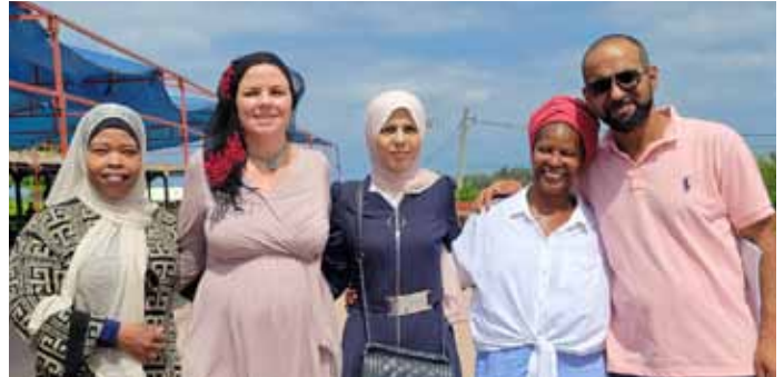
Afaq Jadeeda and Grassroots International Staff

through various means. They also worked to develop healing training workshops with leaders of the social movement, sharing their healing-action methodology in response to sexual violence as well as building a collaborative space with Cakchiquel women from Comalapa. Their pilot project focuses on art as a means of healing among children.