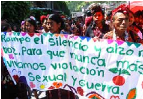
Actoras de Cambio: Breaking silence, Speaking out...

Guatemala emerged from 36 years of armed conflict in 1996 and despite the transitional justice processes and prosecutions of