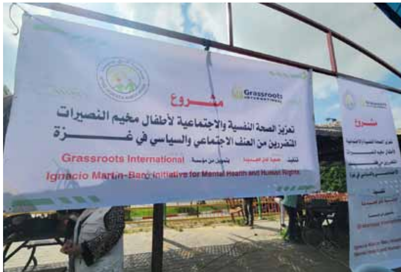
Banner welcoming Grassroots International and MBI to Gaza

“What does it take to love our babies, our living, and our dead in the midst of Israel’s genocidal colonial conquest? How do we care for our massacred bodies and all the collective residues of horror as our people are so violently thrown out of human consideration? When can we release our tears and let them fall free? This is not grief. This is our revolutionary, Indigenous love fighting against the apocalyptic violence of genocide. And when we love like this, anchored in Palestinian feminist praxis, we live and die with dignity, and we become the freedom we are demanding.”