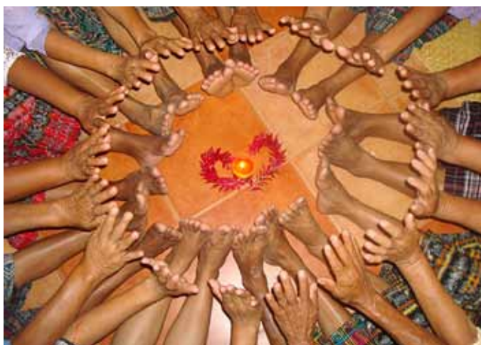
Actoras de Cambio, Guatemala

Support from donors this past year has enabled the Martín-Baró Initiative for Wellbeing and Human Rights at Grassroots International to sustain the funding of 11 grassroots projects. Many of the projects we support are facing devastatingly challenging times including the intensified siege and bombing of Gaza, another re-invasion of Haiti, and violent state repression of peaceful democracy protests in Guatemala. Impacted people will feel the effects of dominant power and its structures for generations.