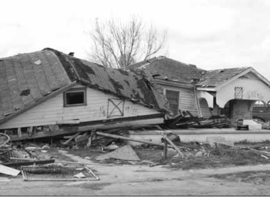
Ninth Ward, New Orleans, January 2006

The consequences of the flooding in New Orleans in the aftermath of Hurricane Katrina highlighted a complex nexus of historical racial and class-based discrimination and governmental inefficiencies about which New Orleanians themselves are organizing. Local activists and