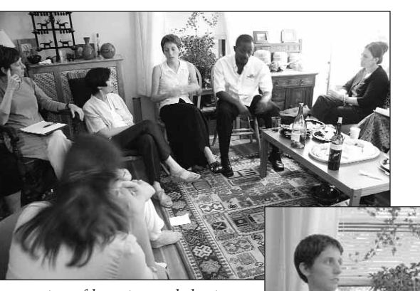
An evening of learning and sharing

In contrast, I found it inspiring and hopeful to learn that the group of women gathered through KOFAVIV was tremendously resilient, resistant, and resourceful in the face of ongoing structural, political, and personal violence. They are clearly victims, but they are also survivors and activists. Rather than accepting the status quo and defining themselves as victims, these Haitian women were motivated