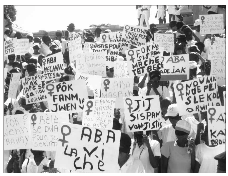
March held by KOFAVIV in Port-au-Prince on September 1, 2006 to denounce violence against women

This song and the women's ability to turn an object used to hide the identity of their attackers into a sign of resistance epitomizes the courage and