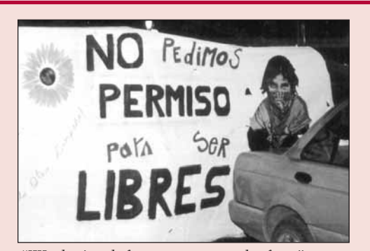
"We don't ask for permission to be free." International Women's Day

Women the world over continue to face human rights violations including rape and physical abuse, as well as verbal and emotional abuse. Women are not only victims of abuse but also serve as strong voices in the struggle for women's rights and social justice. This newsletter focuses on women's resistance in the face of ongoing structural and interpersonal violence.