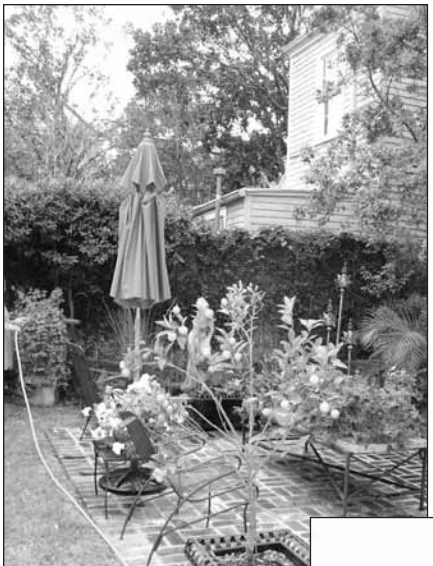
Uptown garden, New Orleans, January 2006

Hurricane Katrina took a disproportionate toll upon the poor and elderly (http://www.dhh.louisiana. gov/news.asp?ID=1&Detail=801) in New Orleans, as well as the African-American population (Sharkey, 2006). During the crisis, reports abounded of rescue efforts and emergency aid that favored the white and privileged. In the wake of the disaster, many have discussed biases that are believed to have contributed both to the lack of a coordinated response to the crisis as well as to the disenfranchisement of the New Orleans African-American population. Commentators as well as citizens criticized responses to Katrina as "ethnic cleansing" of the poor and African-American (Whitney, 2005) and a "massive social engineering project" (Chen, 2005), as those neighborhoods that experienced the worst flooding and have received the least resources since Katrina were predominantly poor and African-American. Yet within this dialogue, and despite significant organizing efforts by women, post-Katrina, media outlets