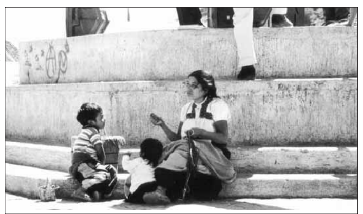
Woman selling handcrafts with her children on the steps of Plaza de Santo Domingo, San Cristóbal, Chiapas

Because she now knows how to read and write, she has come to know her individual rights, as well as her rights as a woman. When she was last beaten she went to the police to press charges. She told the group: I was afraid of what would happen, because he threatened to kill me for sending the police, but it's better to die with a voice than to live in silence.