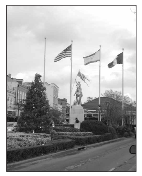
French Quarter, New Orleans, January 2006

A liberation psychology contributes importantly to a critical analysis of the gender, race, and class dynamics of the Katrina crisis and subsequent rebuilding efforts in New Orleans. Critical and liberatory analyses of the psychosocial implications of extreme disasters require both the recognition of the social relationships that are disrupted by traumatic