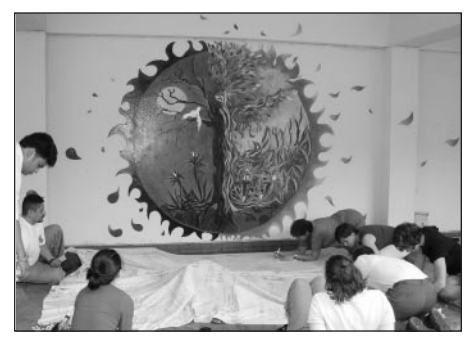
Mural in offices of Centro las Casas.

tion and healing through cooperative game-playing, expressive arts, meditation, yoga, and creative rituals that celebrate and cherish the memory of those killed or 'disappeared' during the civil war. Through cooperative games they challenge the precedence given to individualism and competition forced upon the poor by an excessive,