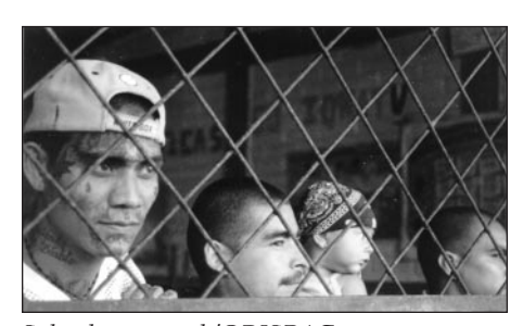
Salvadoran youth/CRISPAZ project

began in El Salvador in April 1990 and the treaty was signed in January 1992. The FMLN's central objective in the negotiations was to reduce the power of the military. Among the many consequences of these peace